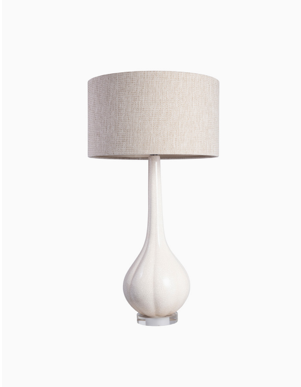
TABLE LAMP | ELENOR