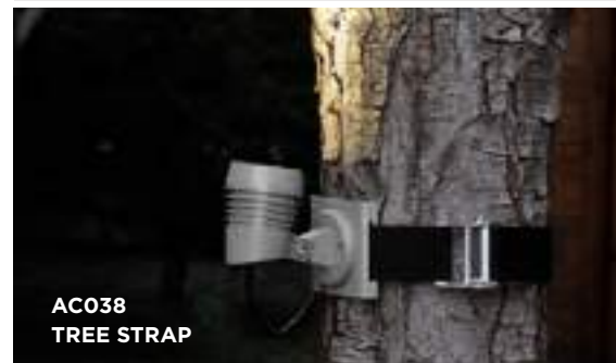
AC038 TREE STRAP