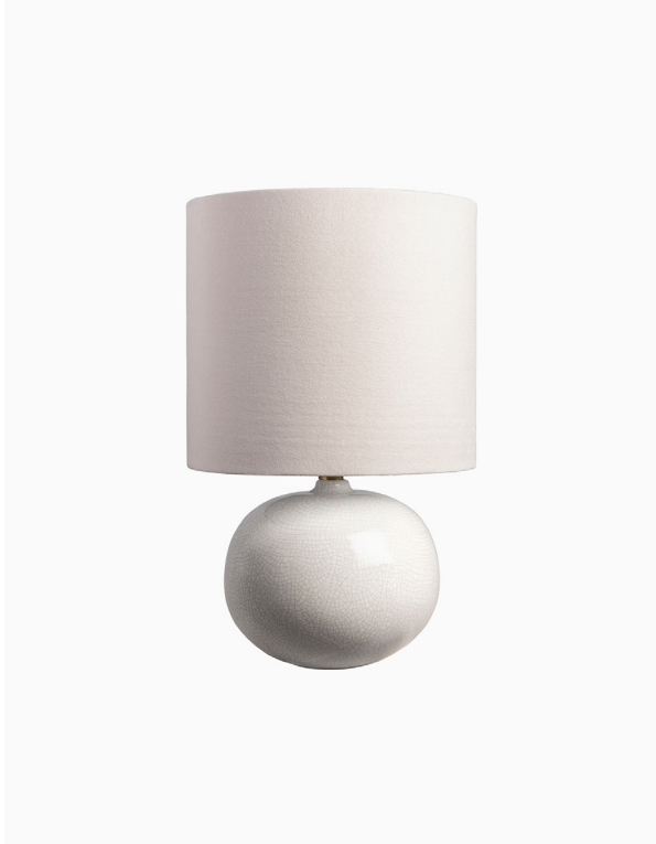
TABLE LAMP | CAMELLIA