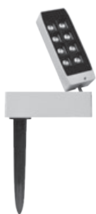
AC037 EARTH SPIKE