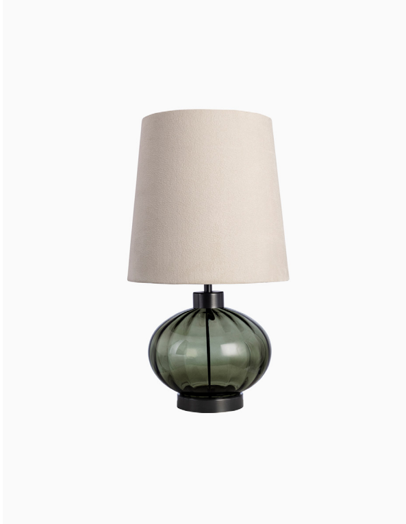
TABLE LAMP | PEDRA MOSS