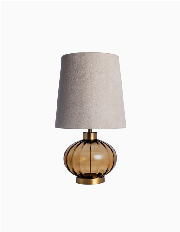
TABLE LAMP | PEDRA AMBER