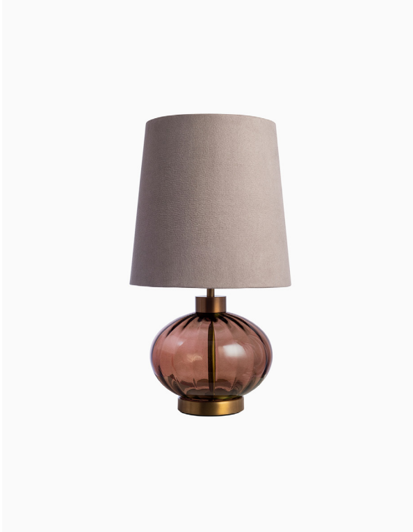
TABLE LAMP | PEDRA DUSK