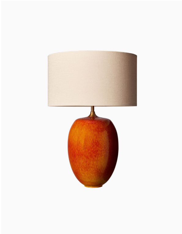
TABLE LAMP | CANYON