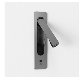
CODE: 1437042 FINISH: POLISHED CHROME

To maintain this product to its best condition, please view our care and cleaning guide on the support section of the astro website.