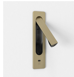
CODE: 1437039 FINISH: MATT GOLD