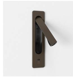
CODE: 1437037 FINISH: BRONZE