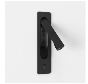
CODE: 1437038 FINISH: MATT BLACK