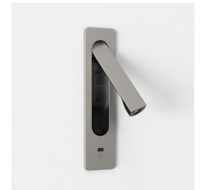
CODE: 1437040 FINISH: MATT NICKEL