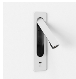
CODE: 1437041 FINISH: MATT WHITE