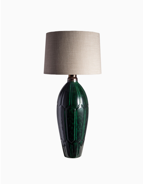
TABLE LAMP | AGAVE