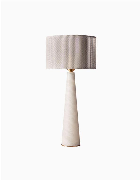
TABLE LAMP | IVES