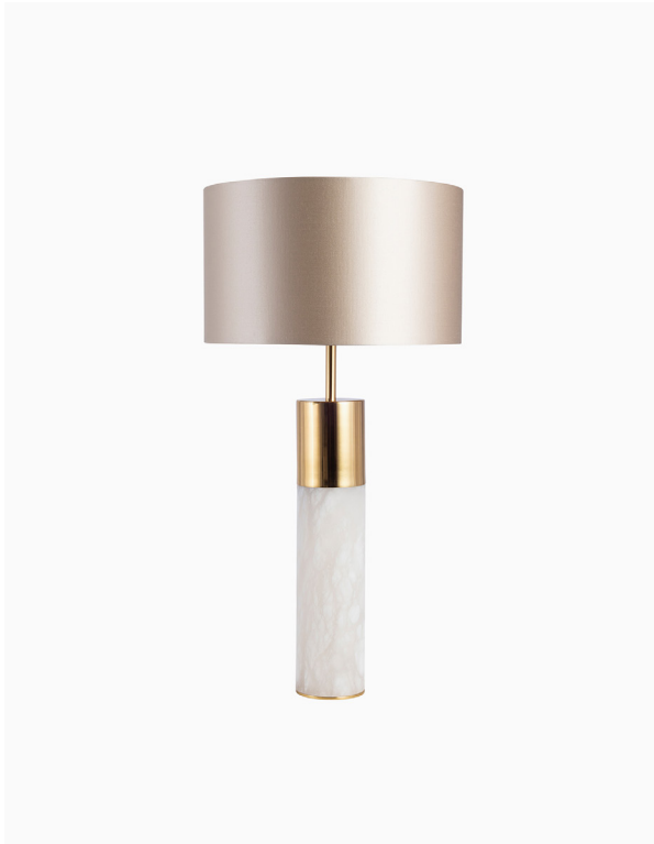
TABLE LAMP | AZAILA