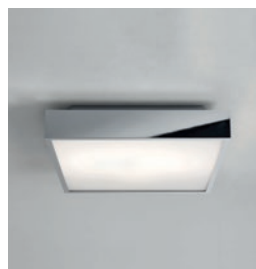
CODE: 1169014 (8529) FINISH: POLISHED CHROME