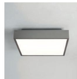
CODE: 1169015 (8530) FINISH: MATT NICKEL

TO MAINTAIN THIS PRODUCT TO ITS BEST CONDITION, PLEASE VIEW OUR CARE AND CLEANING GUIDE ON THE SUPPORT SECTION OF THE ASTRO WEBSITE.