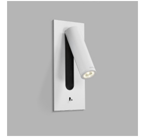
CODE: 1215036 (8103) FINISH: MATT WHITE