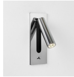
CODE: 1215035 (8102) FINISH: POLISHED CHROME