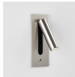
CODE: 1215039 (8106) FINISH: MATT NICKEL

TO MAINTAIN THIS PRODUCT TO ITS BEST CONDITION, PLEASE VIEW OUR CARE AND CLEANING GUIDE ON THE SUPPORT SECTION OF THE ASTRO WEBSITE.