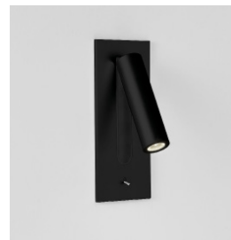
CODE: 1215037 (8104) FINISH: MATT BLACK