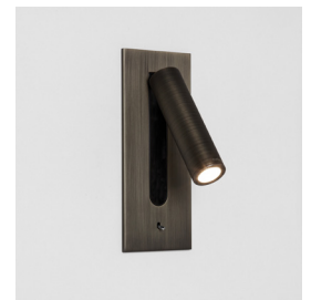
CODE: 1215038 (8105) FINISH: BRONZE