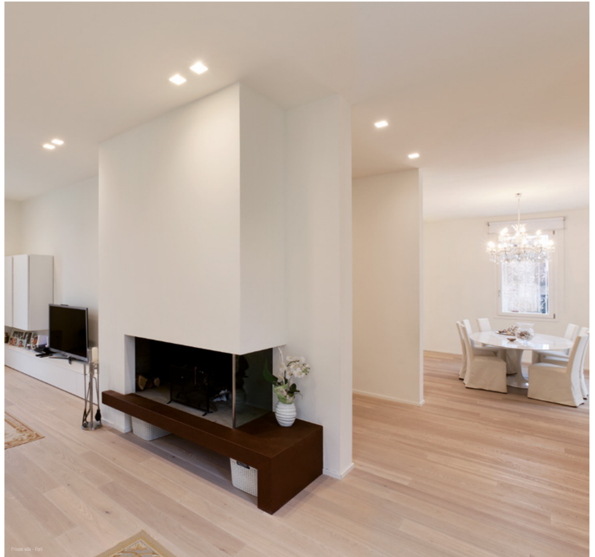
Private house - ASZ Architeti