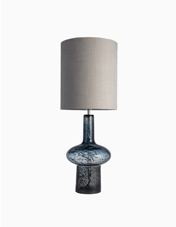
TABLE LAMP | VERDI INDIGO BLUE