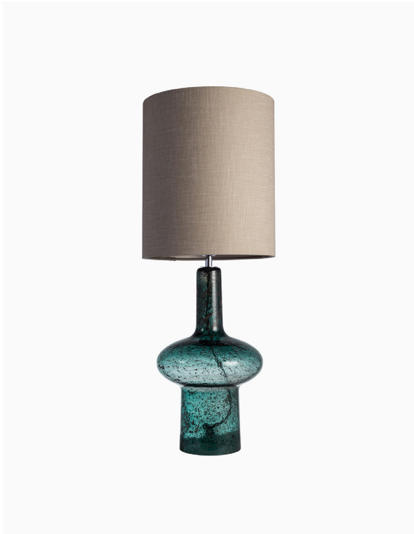
TABLE LAMP | VERDI OCEAN