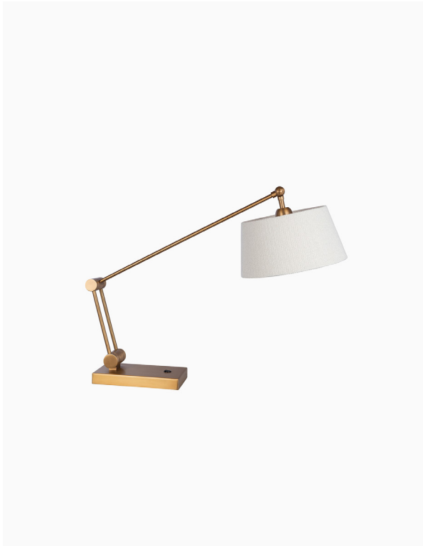
TABLE LAMP | TORUN