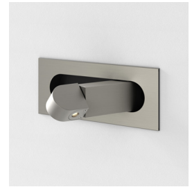
CODE: 1323045 FINISH: MATT NICKEL