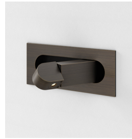
CODE: 1323042 FINISH: BRONZE