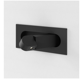
CODE: 1323043 FINISH: MATT BLACK