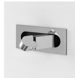
CODE: 1323046 FINISH: POLISHED CHROME

To maintain this product to its best condition, please view our care and cleaning guide on the support section of the astro website.