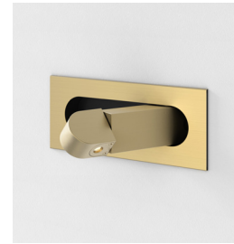
CODE: 1323044 FINISH: MATT GOLD