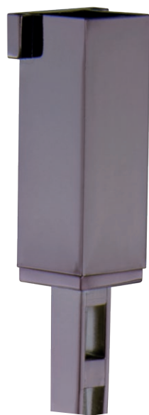
black rhenium colour plated