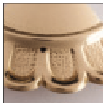
ottone lucido 106 polished brass 106