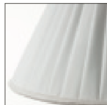
plissé bianco 086 white pleated 086