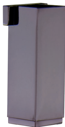
black rhutenium colour plated