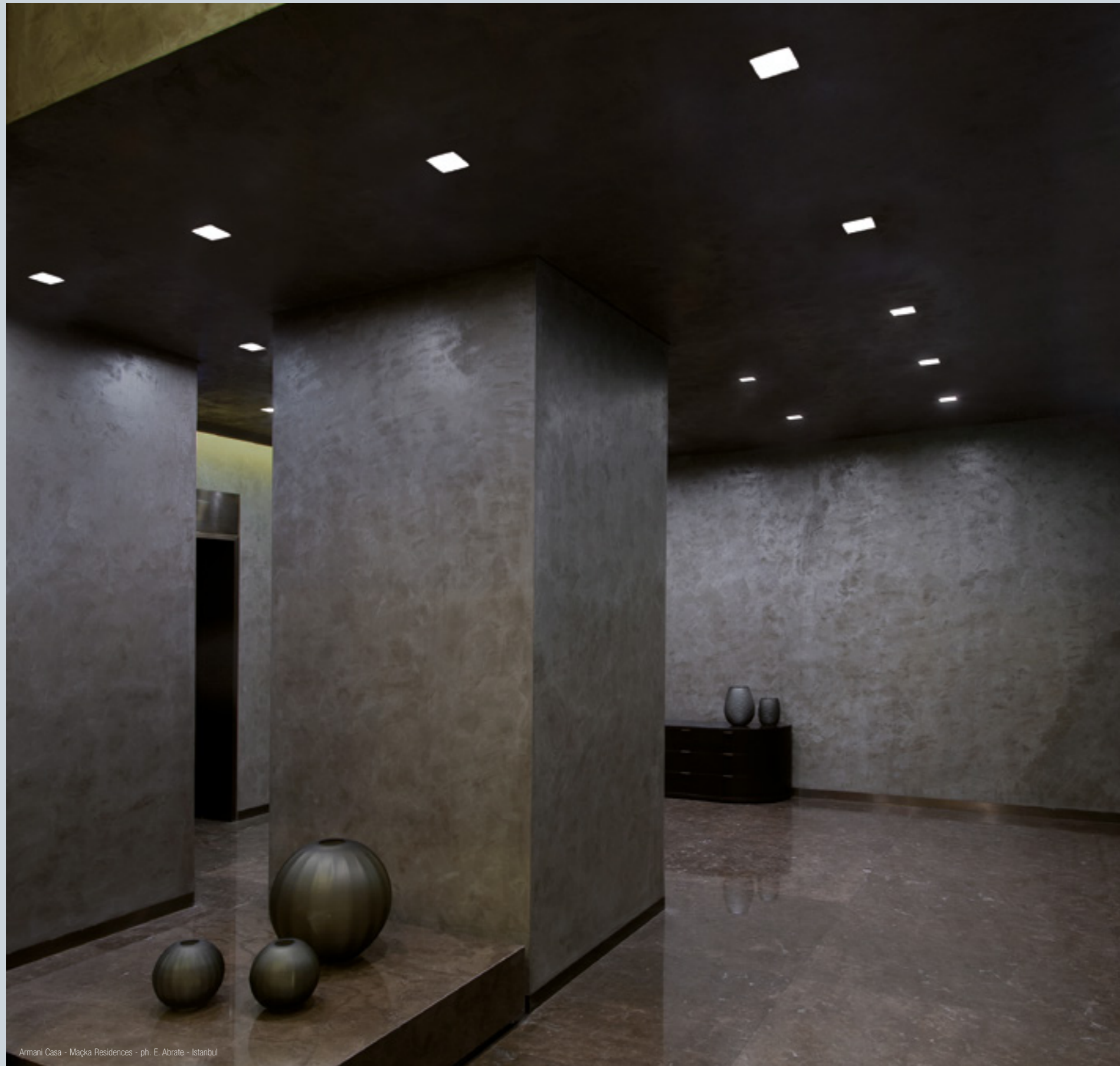
Armani Casa - Maçka Residences - Istanbul