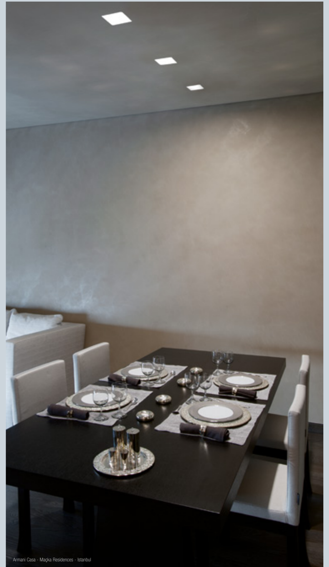
Armani Casa - Maçka Residences - Istanbul