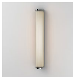
CODE: 1380011 (8482) FINISH: POLISHED CHROME