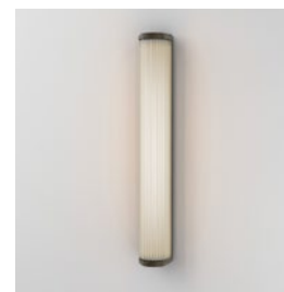
CODE: 1380012 (8483) FINISH: BRONZE

TO MAINTAIN THIS PRODUCT TO ITS BEST CONDITION, PLEASE VIEW OUR CARE AND CLEANING GUIDE ON THE SUPPORT SECTION OF THE ASTRO WEBSITE.