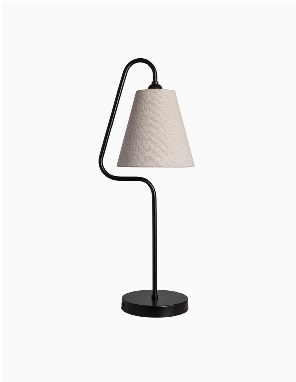
TABLE LAMP | ALFA