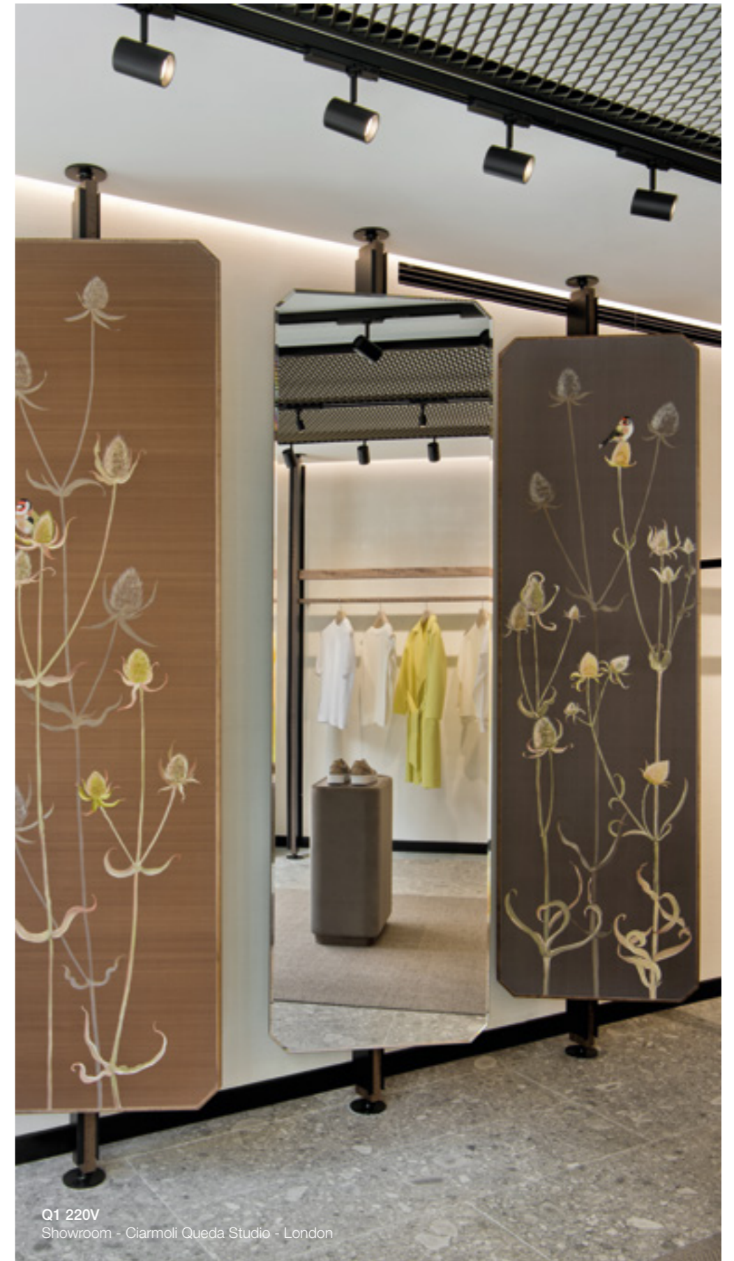
Q1 220V Showroom - Ciarmoli Queda Studio - London