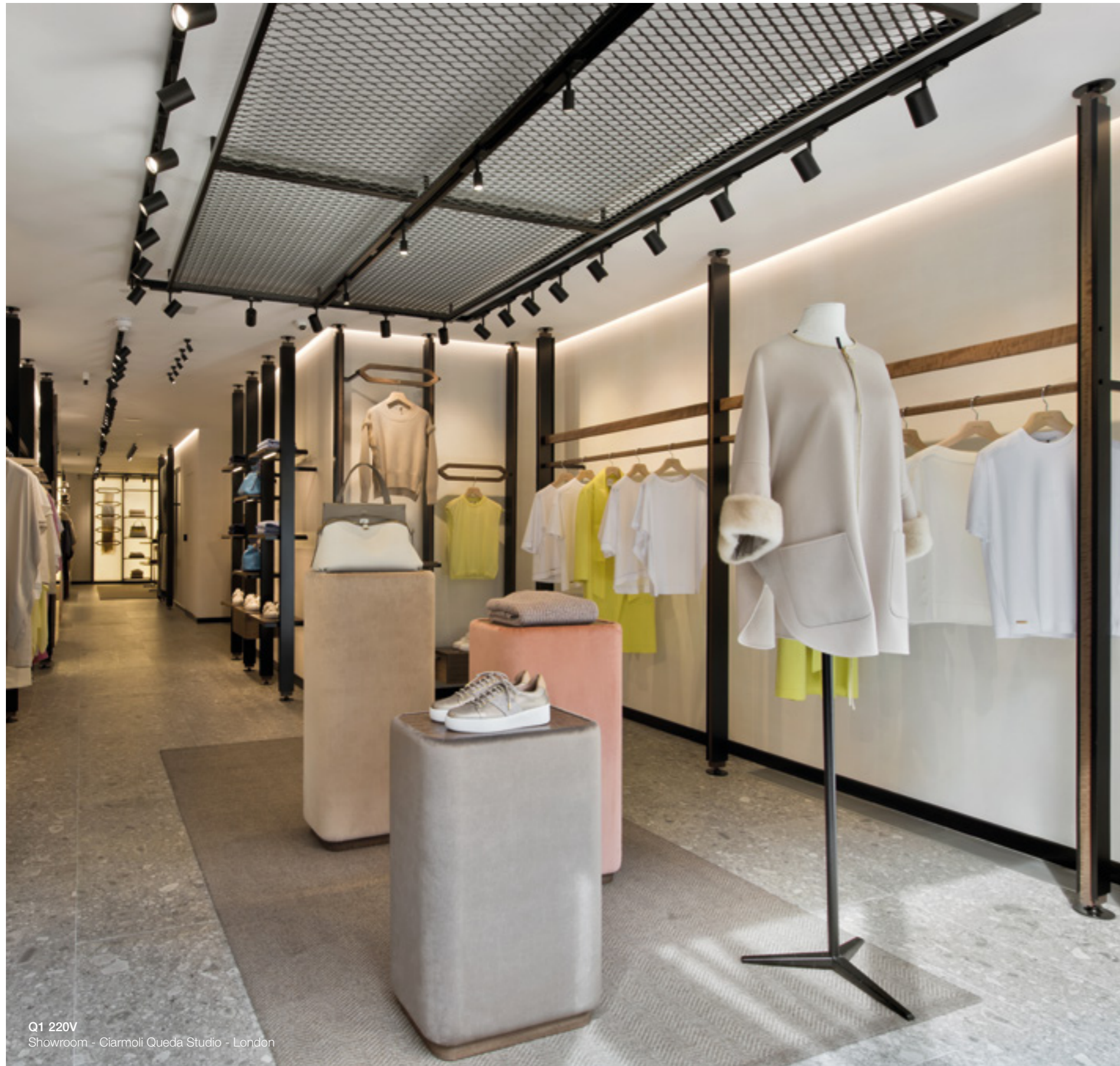
Q1 220V Showroom - Ciarmoli Queda Studio - London