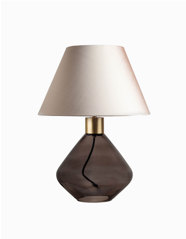
TABLE LAMP | NOA