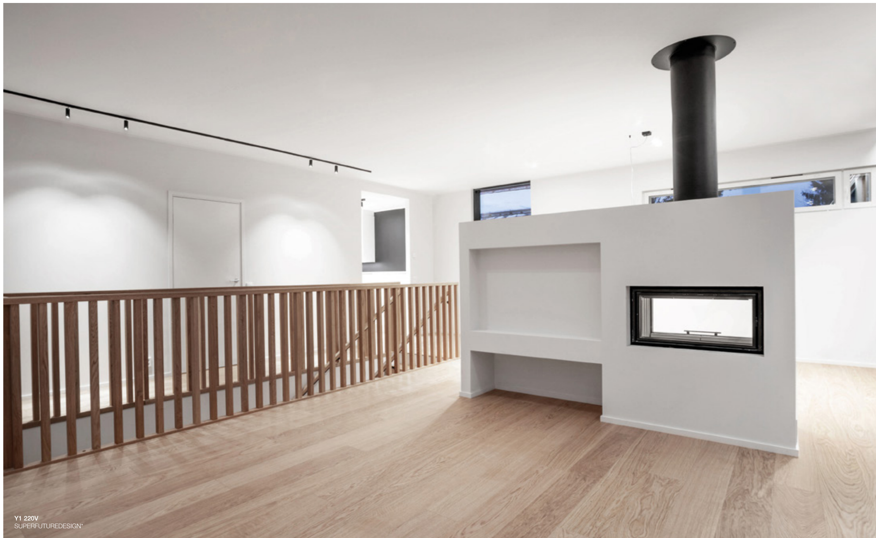
Y1 220V SUPERFUTUREDESIGN*