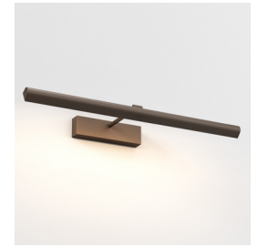
Code: 1371029 Finish: Bronze