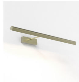
Code: 1371032 Finish: Matt Brushed Brass

To maintain this product to its best condition, please view our care and cleaning guide on the support section of the astro website.