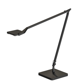
Table lighting fixture for interiors, with swivelling light beam.

Pickled sheet metal bearing base in polyacrylic paint.