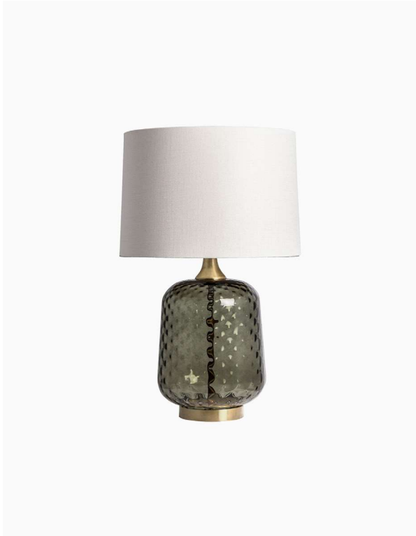
TABLE LAMP | RISCO OLIVE