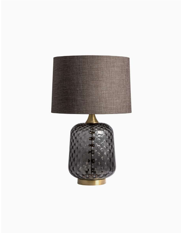
TABLE LAMP | RISCO SMOKE