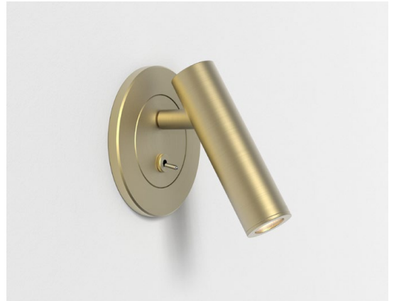
CODE: 1058190 FINISH: MATT GOLD

To maintain this product to its best condition, please view our care and cleaning guide on the support section of the astro website.