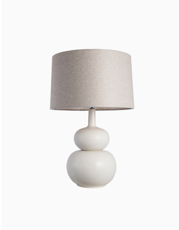
TABLE LAMP | PERLE