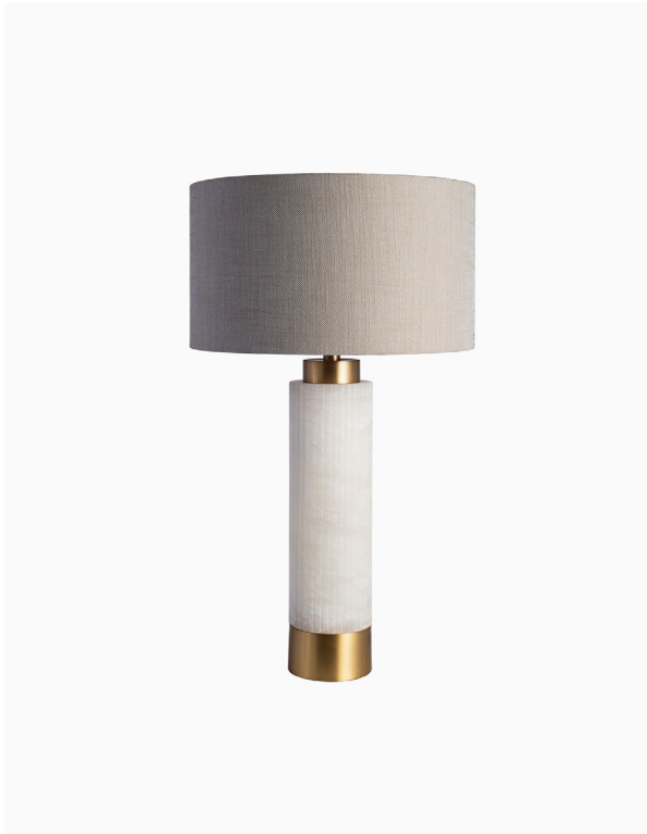
TABLE LAMP | ROCA