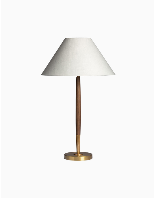
TABLE LAMP | RONNI