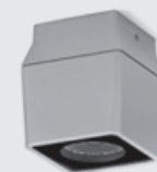
AC071 HONEYCOMB LOUVER