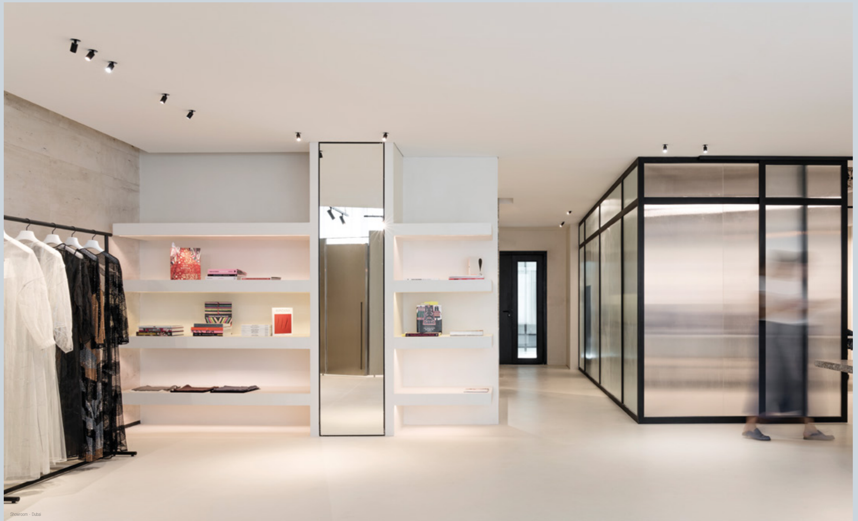
Showroom - Dubai